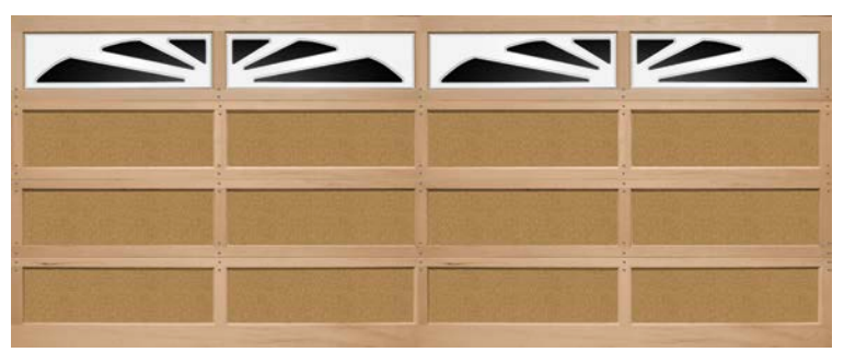
Sunset (16' Wide)