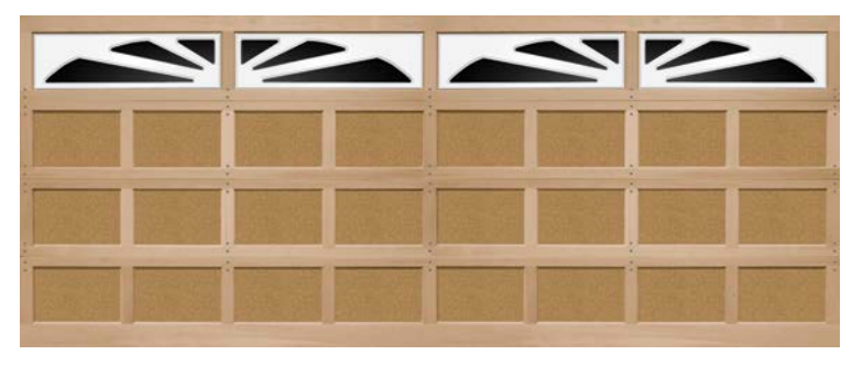
Sunset (16' Wide)