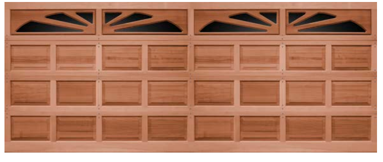
Horizon (16' Wide)