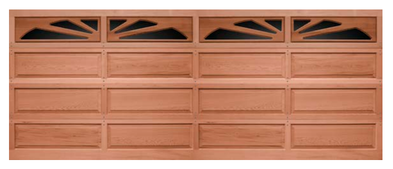
Horizon (16' Wide)