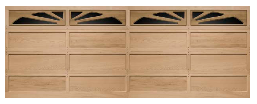
Horizon (16' Wide)