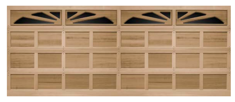
Horizon (16' Wide)