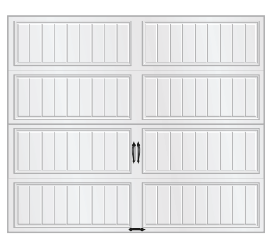
Long Panel (GD5L, GD5LV, GD4L and GD4LV)

GD5S/GD5SV available 5'0"-18'0" wide in 2" increments (excludes 10'2"-11'4" and 14'8"). GD4S/GD4SV available 5'0"-20'0" wide in 2" increments (excludes 10'2"-11'4" and 14'8"). GD5L/GD5LV available 7'8"-18'0" wide in 2" increments (excludes 10'2"-11'4" and 14'8"). GD4L/GD4LV available 7'8"-20'0" wide in 2" increments (excludes 10'2"-11'4" and 14'8"). All doors available 6'0"-16'0" high in 3" increments. Standard hardware shown above.