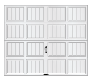
Short Panel (GD5S, GD5SV, GD4S and GD4SV)