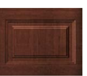
Classic Cherry Finish