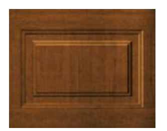
Classic Medium Finish